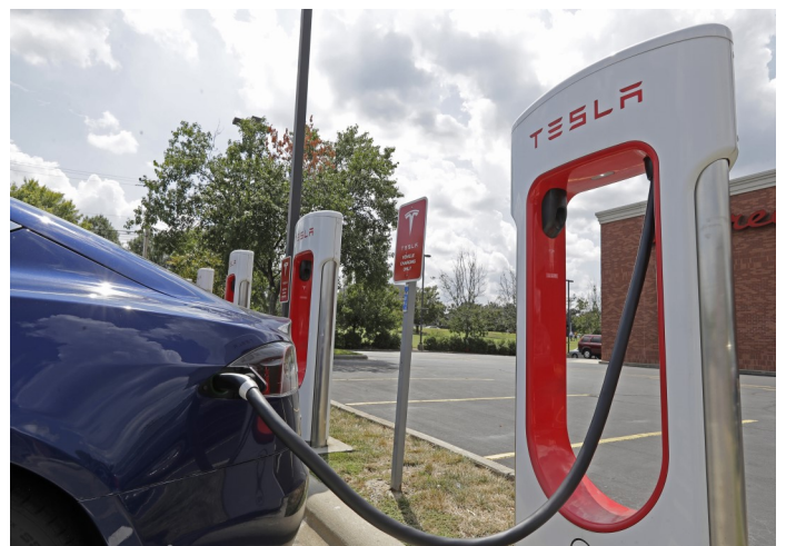
14-Stall Tesla Supercharger Station