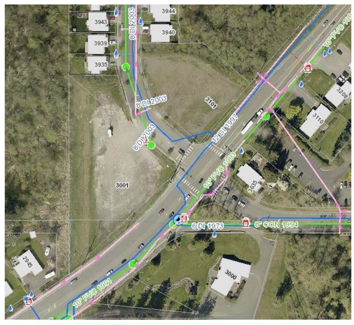
BLUE: COB WATER GREEN: SEWER PINK: STORM WATER